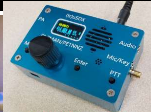
(tr)uSDX Aluminum Case