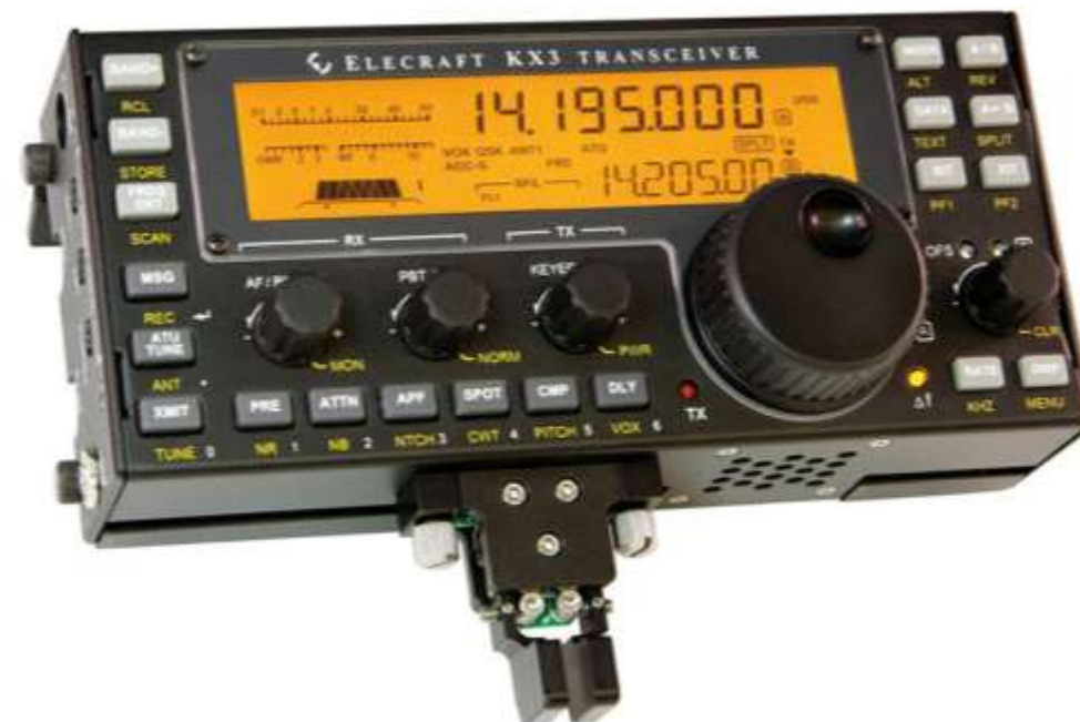
KX3 and KXPD3 paddle (sold separately)